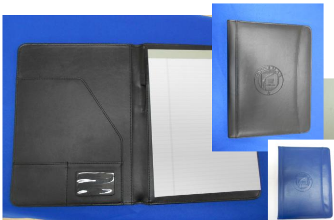
CALLERLAB Pad folio in Blue or Black