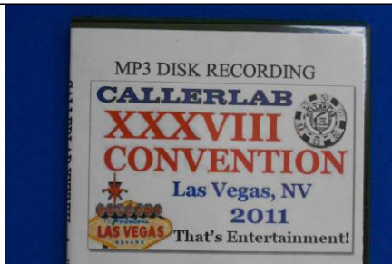
Convention Recordings in MP3