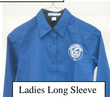
Ladies Long Sleeve