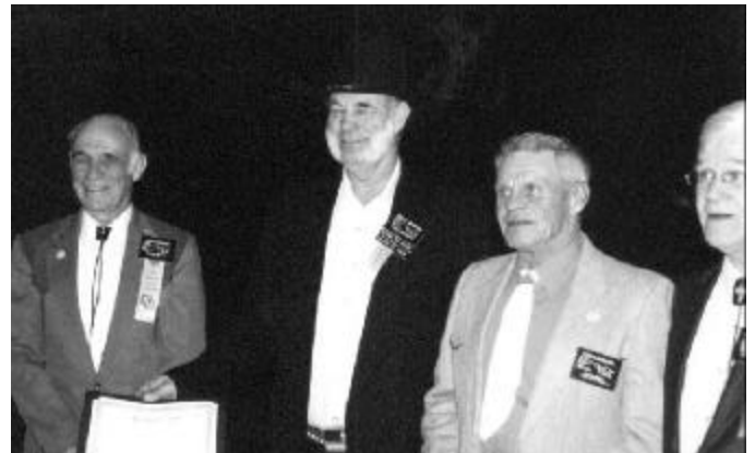
50 Year Recipients