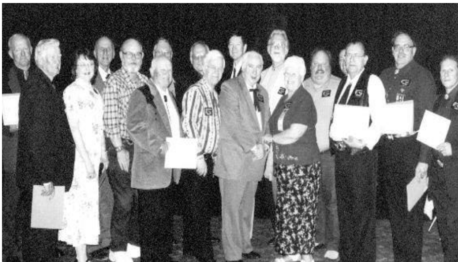
25 year Recipients