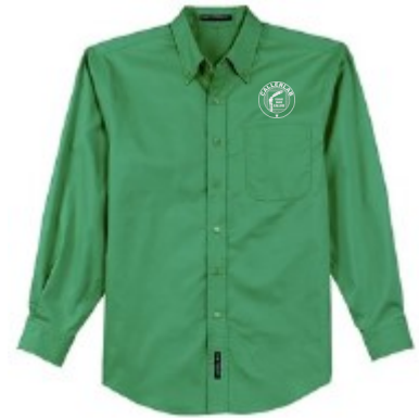
Color Shown is Court Green