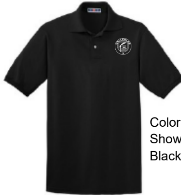
Color Shown is Black