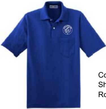
Color Shown is Royal