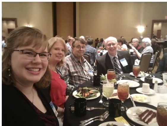
CALLERLAB, The International Association of Square Dance Callers